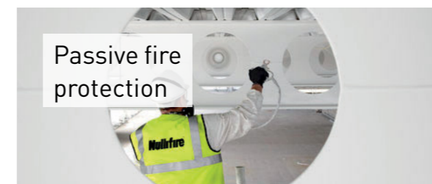
Passive fire protection

The product brands housed within CPG Europe cover a wide array of different construction needs and provide a wealth of complex services, support and systems that are rarely found together under one roof.